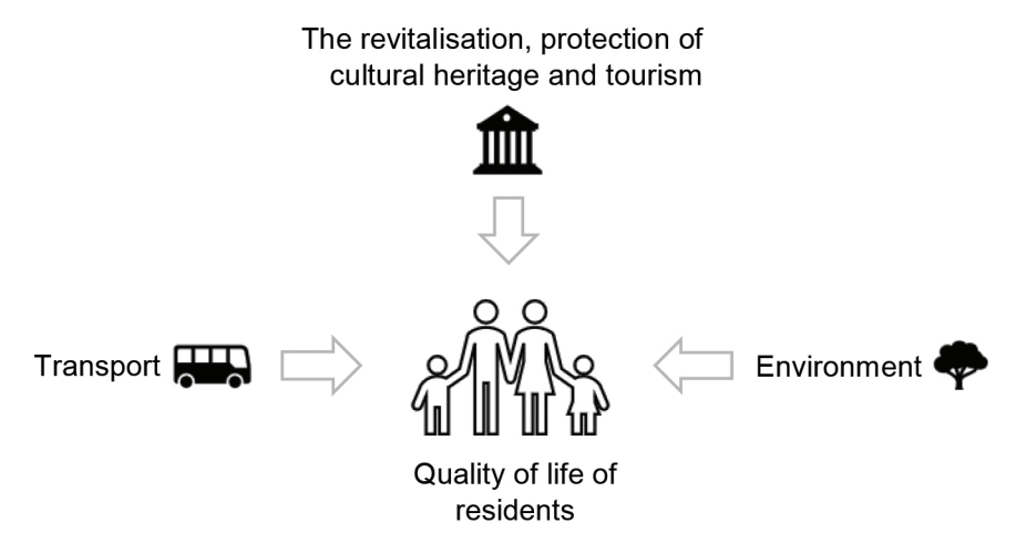
Fig. 2. Areas of intervention within the framework of the cohesion policy having the greatest impact on the quality of life in large cities

It can be concluded based on the analysis that among the urban development projects implemented under the cohesion policy in 2007–2013 – transport; environment and energy; revitalisation, protection of cultural heritage and tourism; social infrastructure; entrepreneurship and innovation; development of local education; development of local employment - the areas indicated in Figure 2 were of the greatest importance to the quality of life.